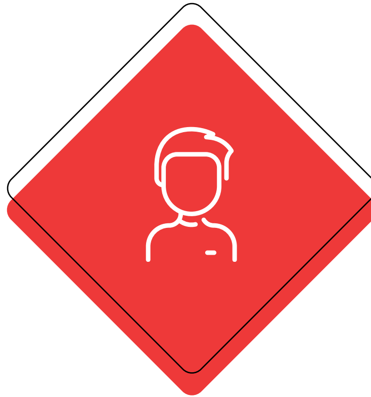
Transportation organizer (charterer)