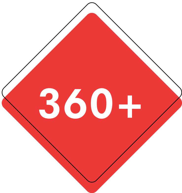
Local accredited providers