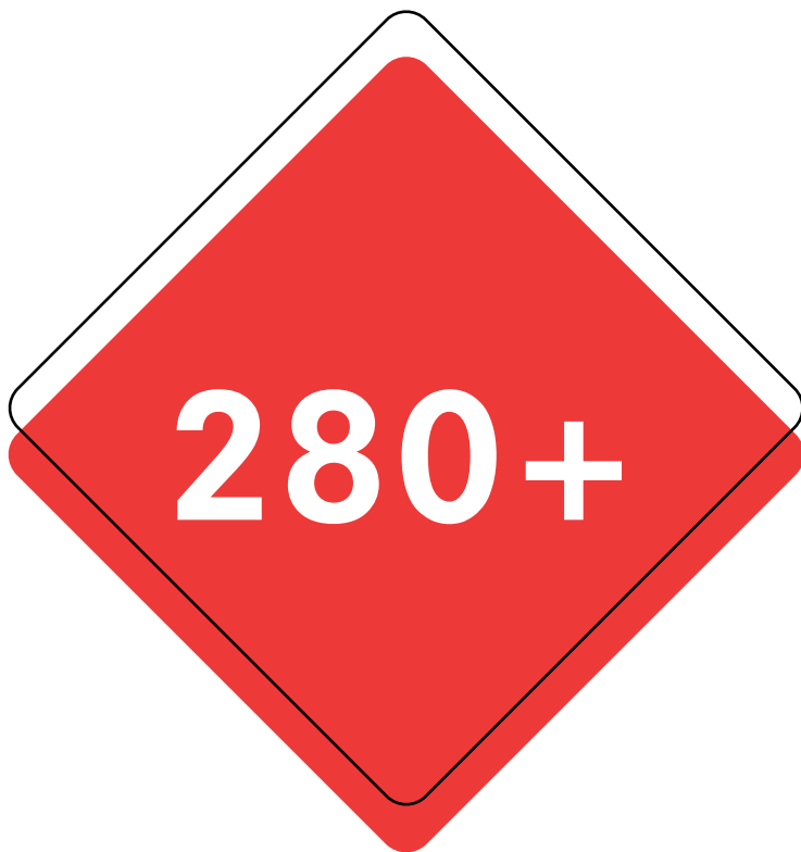
Cities and towns

We are ready to carry out tasks of any complexity for the safe and comfortable transportation of passengers, employees, managers and your guests in all capitals of the regions of Russia and in hundreds of small settlements from 50,000 people. Upon request, we organize taxi and transfer services in any other settlements that are not served by us as soon as possible. In large cities of Russia, we have several local accredited providers of ground transportation services under direct contracts without intermediaries.