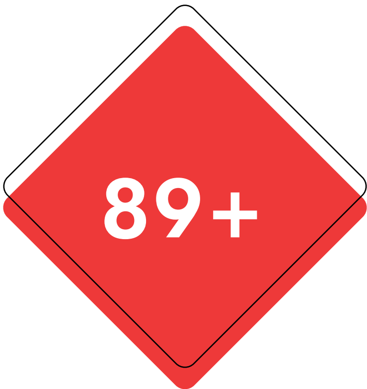
Territories and regions of Russia